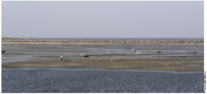
Many shellfish aquaculturists head out to work their farm when the tide is out and their farms are exposed.

Injury to a Mander of the Public Responsible shellish farmers should do their best to maintain a safe and clean shellish form Still, the Manuchusetts